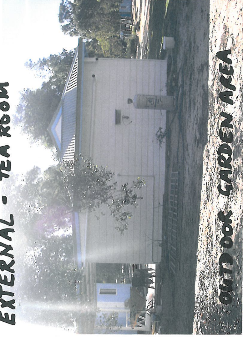
OUTDOOR GARDEN AREA