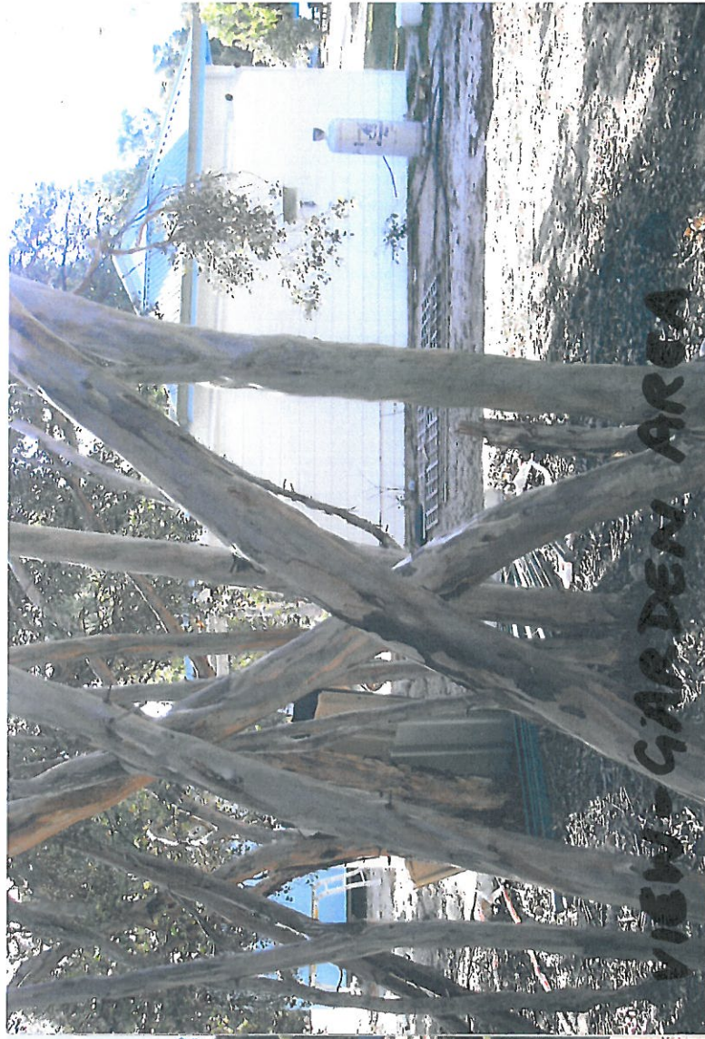
VIEW - GARDEN AREA