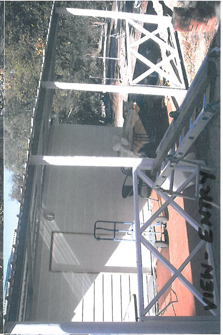
VIEW - ENTRY