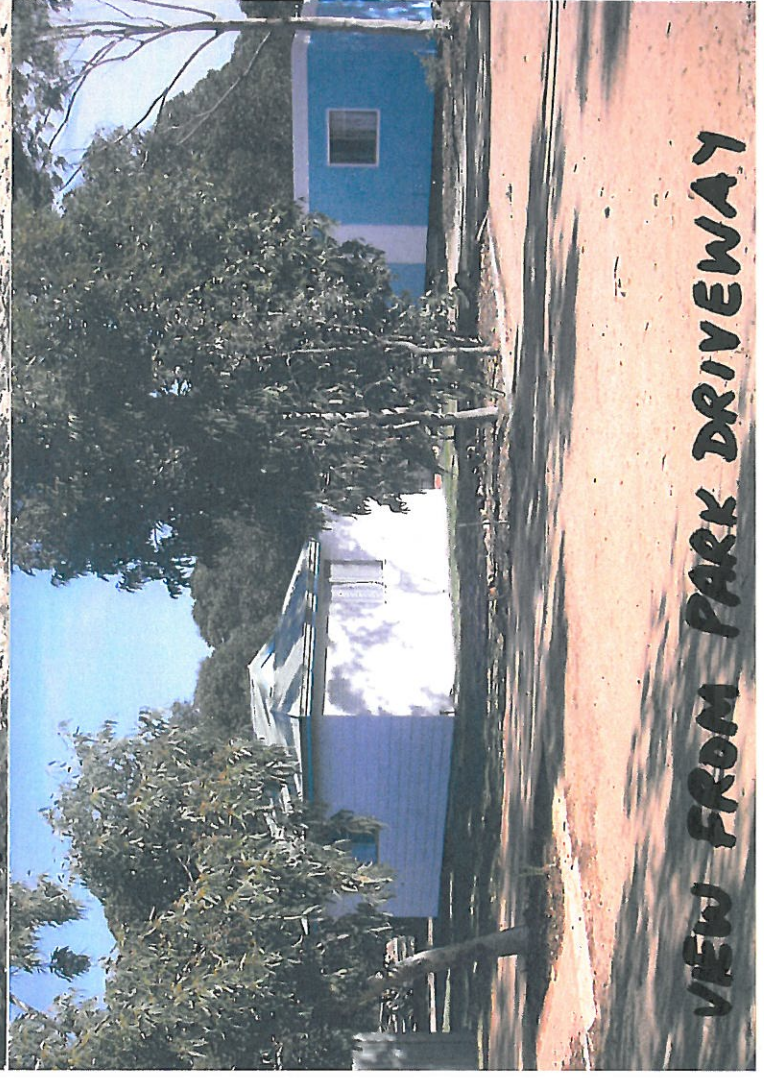
VIEW FROM PARK DRIVEWAY